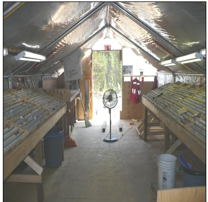
Inside the Core Shack at Lustdust

The Skarn Extension at the north end of the CCS has yet to be defined and remains open along strike and down dip. The 2009 drilling campaign intercepted mineralization in 14 of the 17 holes drilled and it confirmed continuity along the Canyon Creek Skarn zone and further evidence of the mineralization extending north and south.